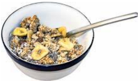
cereal without sugar

Make sure you have breakfast every day. Plus one main meal and one light meal.