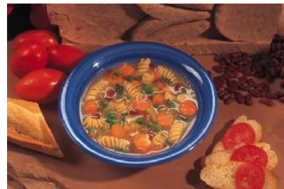
vegetable soup with pasta